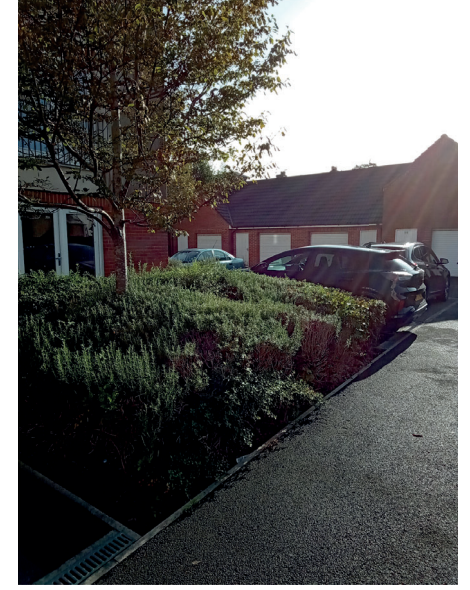
Communal Grounds (Gardens and Common Areas)