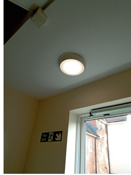
Lighting (Standard and Emergency Lights)