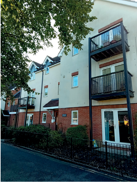
Exterior Structure (The Building)