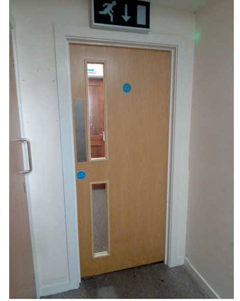
Internal Doors (Compartment Doors)