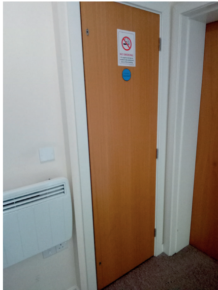
Cupboard Doors (Electrical Cupboard Doors)