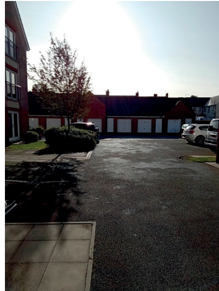
Car Park (Vehicle Parking)