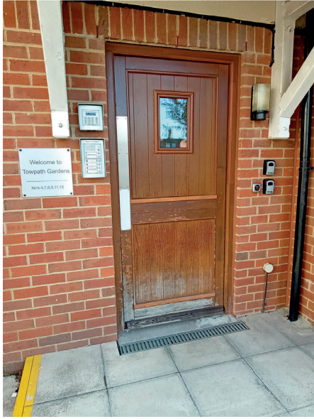
Entrances (Main Doors)