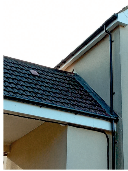
Roofing (Tiles and Cladding)