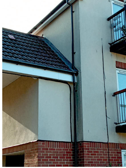
Guttering (Gutters and Fascia)