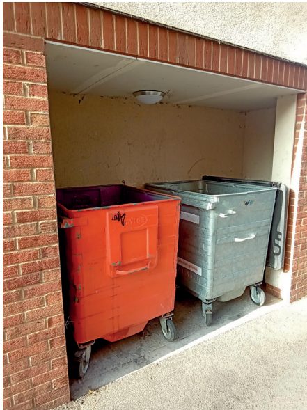
Bin Store (Waste Disposal Area)