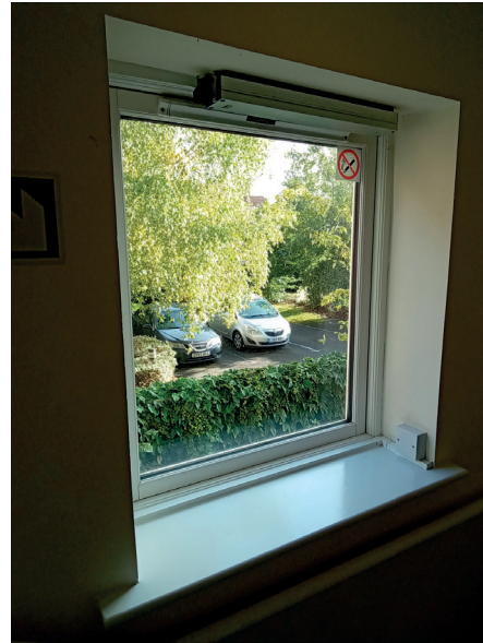
Windows (Communal Windows)